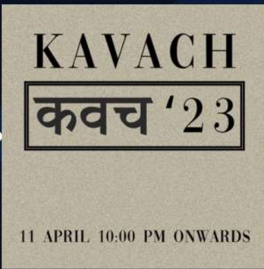
Kavach Cybersecurity Hackathon