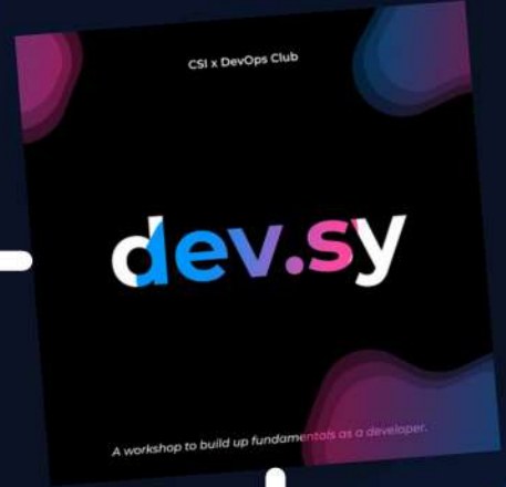
dev.sy DevOps & API Building workshop