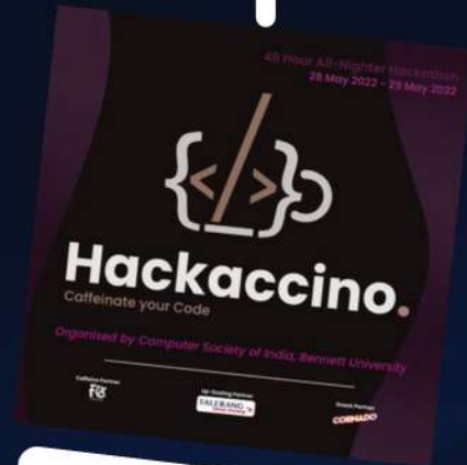
Hackaccino 48 Hours Hackathon