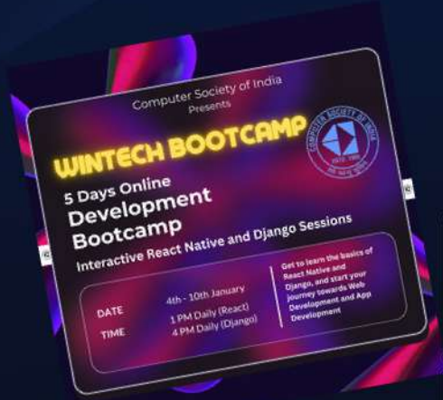
WinTech Bootcamp 5 Days App Dev & Web Dev Bootcamp