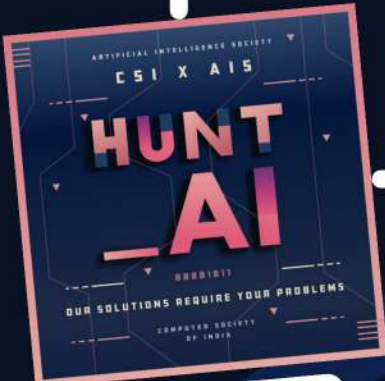
Hunt_AI AI workshop, ideathon, & Hackathon